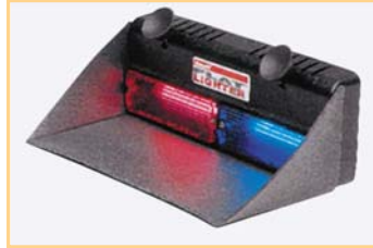
Model FLKIT optional foam rubber shroud for windshield mounting.