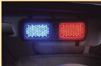
Easily flipped down with visor mount, Model FLLEDBR brightly lit at night.