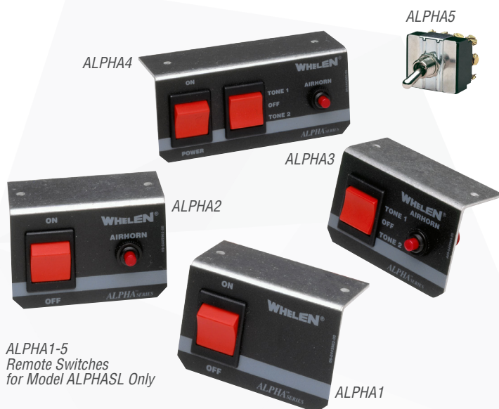
ALPHA1-5 Remote Switches for Model ALPHASL Only

ALPHA 1-4 Switches include "L" mounting bracket. NOT for motorcycle use.