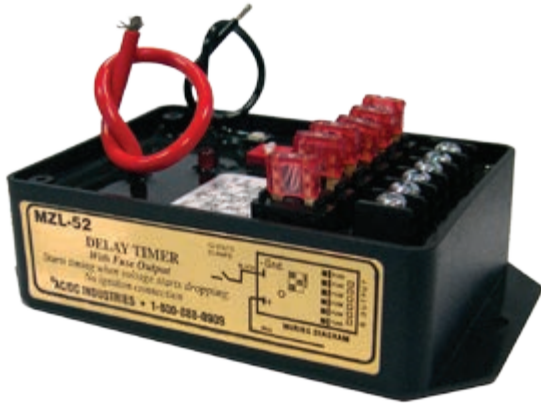
With 6 Fuse Panel Fuses are not included