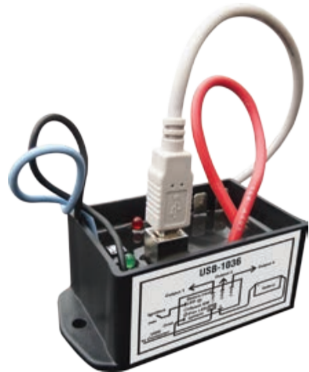
Laptop Shutdown Option